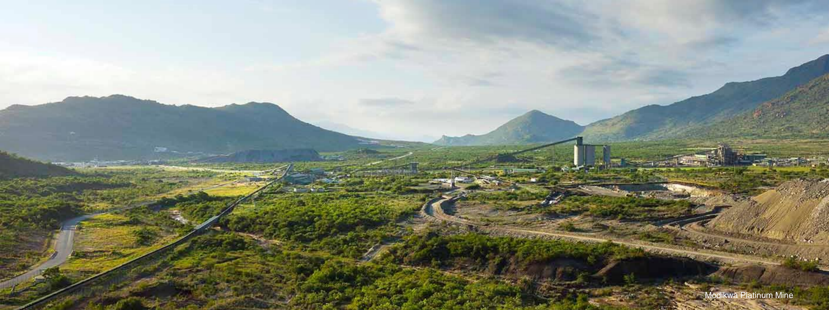
Modikwa Platinum Mine